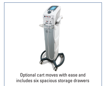
Optional cart moves with ease and includes six spacious storage drawers