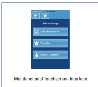
Multifunctional Touchscreen Interface