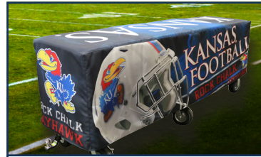
Game Day Cover