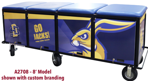
A2708 - 8' Model shown with custom branding