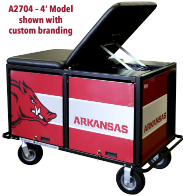
A2704 - 4' Model shown with custom branding