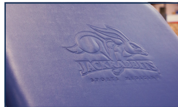
Deboss on Lift Back Cushion