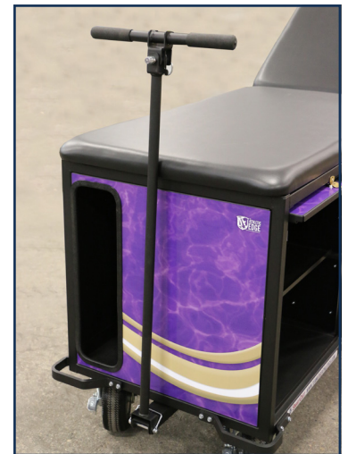
Hitch and T-Pull Handle