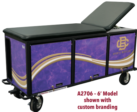
A2706 - 6' Model shown with custom branding