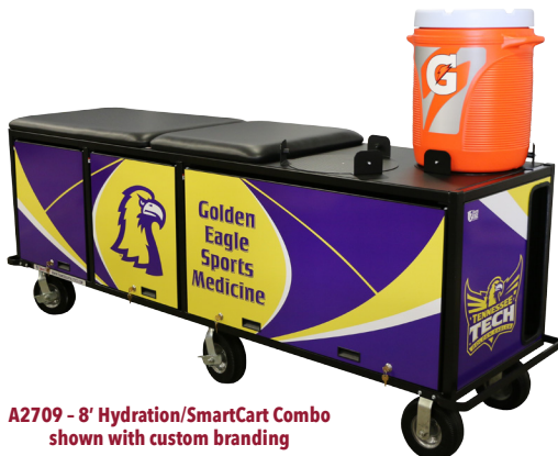
A2709 - 8' Hydration/SmartCart Combo shown with custom branding