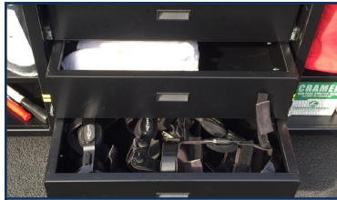
3 Drawer Cabinet