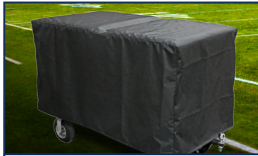
All Weather Cover