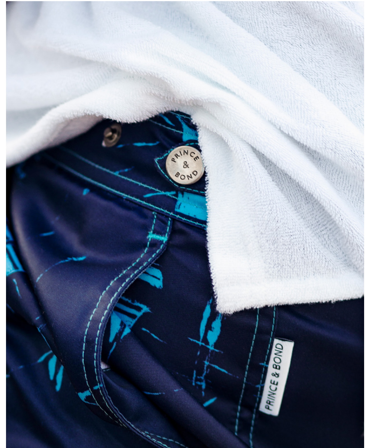
SET SAIL Our new painterly drawn nautical motif shorts