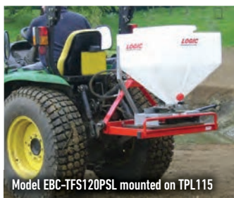
Model EBC-TFS120PSL mounted on TPL115

Engine Driven Spreaders are designed for soft ground or when no tractor is available. The hopper can be filled to suit the towing vehicle.