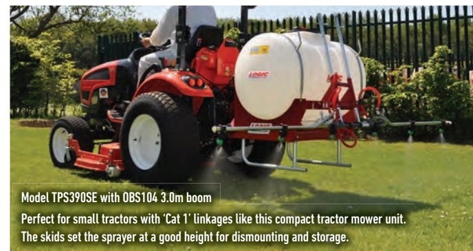
Model TPS390SE with OBS104 3.0m boom

Trailed sprayers are compact with conventional features, ideal for a wide range of suitable vehicles. The model seen here has a 270 litre capacity with a 3m boom and would be suitable for medium to large sized paddocks.