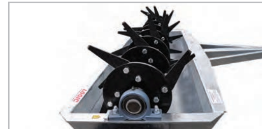
Operating width is 1.6m with 32 x 6mm high-carbon steel blades designed to penetrate ground with as little effort as possible. The transport position naturally offers easy access for any maintenance, including greasing.