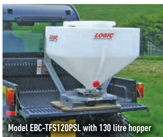
Model EBC-TFS120PSL with 130 litre hopper