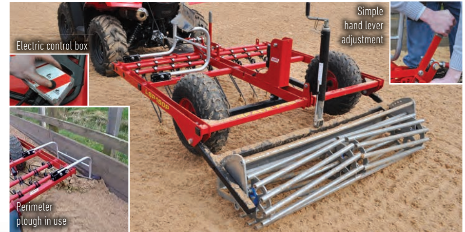
Electric control box

'Surface-Pro' with electric raise and lower, is an easy to use conditioner to level and compact to the firmness required for your riding discipline, including on the latest wax composite surfaces.