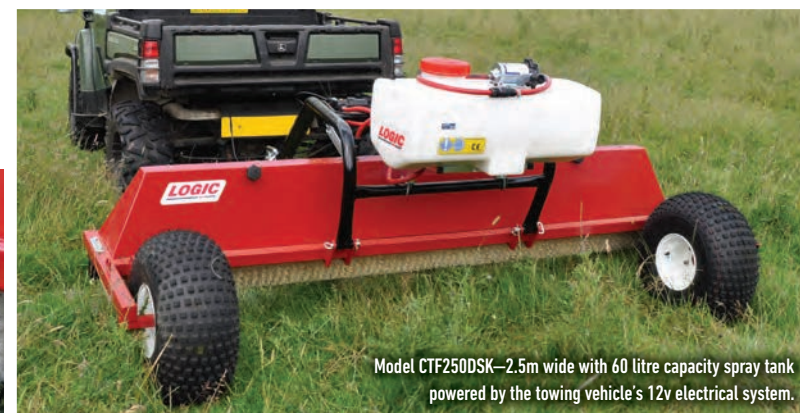
Model CTF250DSK—2.5m wide with 60 litre capacity spray tank powered by the towing vehicle's 12v electrical system.