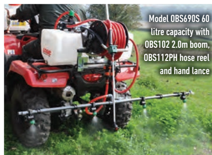
Model OBS690S 60 litre capacity with OBS102 2.0m boom, OBS112PH hose reel and hand lance

There is a wide model range powered by the host vehicle's 12v electrical system, with capacities, hand lances and booms to suit every situation. Contact a Logic dealer or one of our offices for more advice.