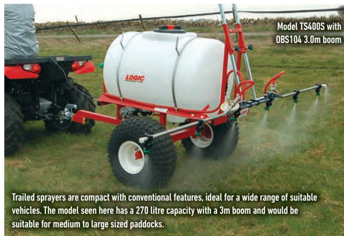
Model TS400S with OBS104 3.0m boom

Trailed sprayers are compact with conventional features, ideal for a wide range of suitable vehicles. The model seen here has a 270 litre capacity with a 3m boom and would be suitable for medium to large sized paddocks.