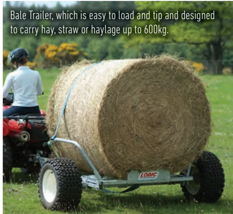
Bale Trailer, which is easy to load and tip and designed to carry hay, straw or haylage up to 600kg.

Logic tipping trailers are tapered to ensure the load empties easily. The tailgate doubles as a loading ramp for wheelbarrows, etc. and the body is spring loaded to help tipping. The model (left) has optional prop stands and jockey wheel fitted.