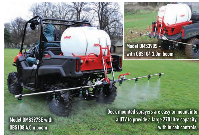
Model DMS397SE with OBS108 4.0m boom

Perfect for small tractors with 'Cat 1' linkages like this compact tractor mower unit. The skids set the sprayer at a good height for dismounting and storage.