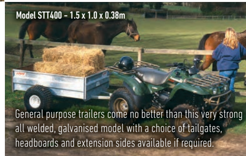
Model STT400 - 1.5 x 1.0 x 0.38m

Using this trailer to transport bales to a field is a one-person job and takes minimum effort thanks to the unique double pivot system, manual winch and sturdy straps.