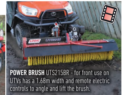
POWER BRUSH UTS215BR - for front use on UTVs has a 1.68m width and remote electric controls to angle and lift the brush.