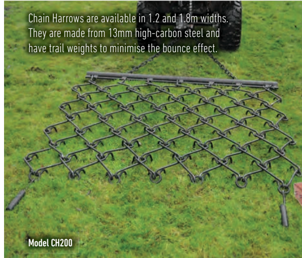
Chain Harrows are available in 1.2 and 1.8m widths. They are made from 13mm high-carbon steel and have trail weights to minimise the bounce effect.

Chain Harrows are simple and economic drag units, ideal for levelling, scarifying and improving the health and appearance of paddocks.