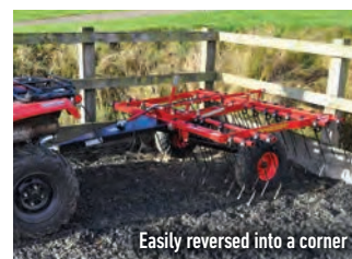
Easily reversed into a corner

The Logic Super-Harrow provides superior harrowing on all surfaces. The frame incorporates a 12v ram, which means the implement can be raised and lowered easily to regulate the pressure on the tines for delicate surfaces and when reversing into corners or transporting to storage. Its unique 'float' mechanism allows the harrow to work effectively on uneven ground. The tines are adjustable so that you can fine tune the harrow to perform different tasks, eg. simple harrowing through to re-grading gallops.