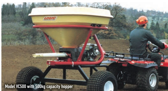
Model VC500 with 500kg capacity hopper

Engine Driven Spreaders are designed for soft ground or when no tractor is available. The hopper can be filled to suit the towing vehicle.