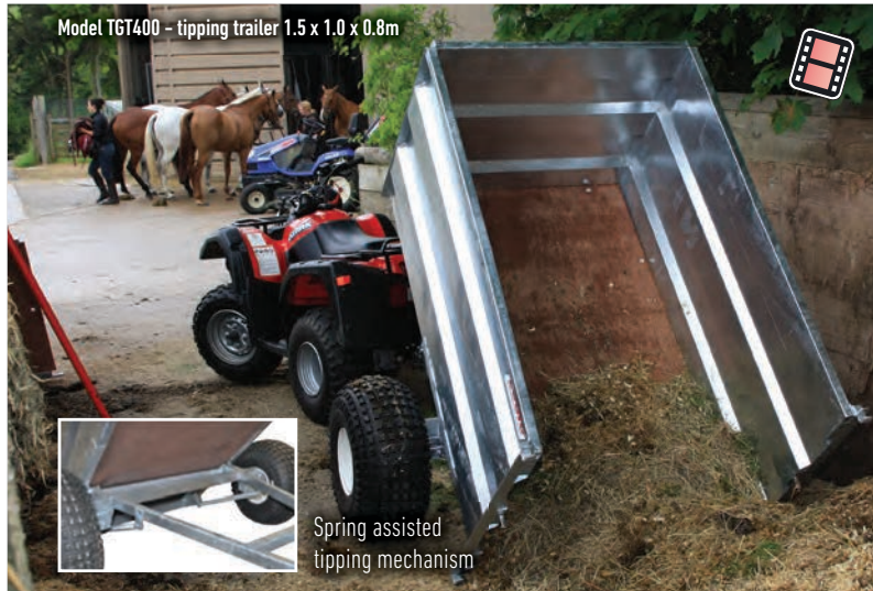
Model TGT400 - tipping trailer 1.5 x 1.0 x 0.8m