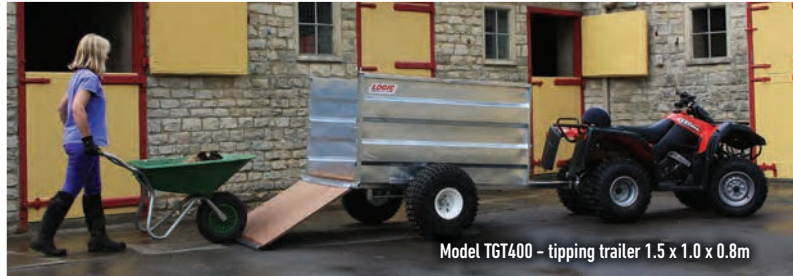
Model TGT400 - tipping trailer 1.5 x 1.0 x 0.8m

Trailers are a simple but important tool for any busy equestrian. The amount of time and hard work saved with the use of a suitable trailer can be tremendous. Logic has a range of models to cover most requirements and sizes to go behind any suitable vehicle with a 50mm tow ball.