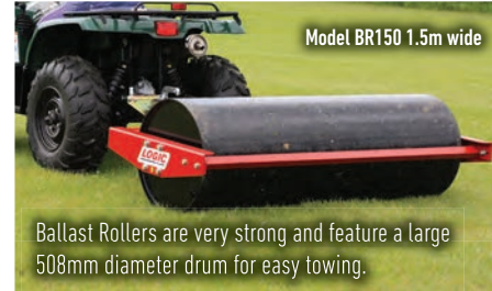
Model BR150 1.5m wide

Ballast Rollers are perfect for levelling soft ground or for use after reseeding worn areas.