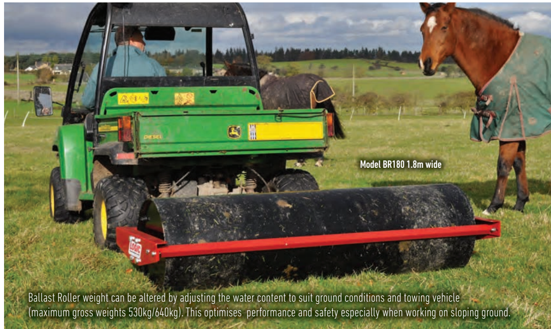
Model BR180 1.8m wide