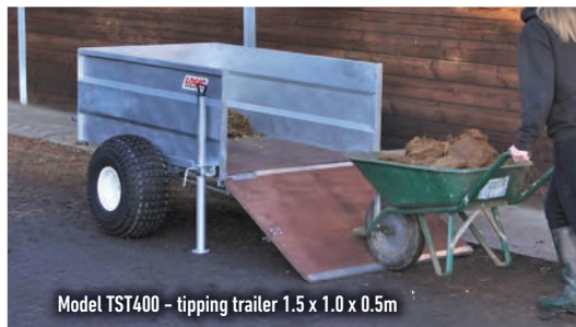
Model TST400 - tipping trailer 1.5 x 1.0 x 0.5m

Logic tipping trailers are tapered to ensure the load empties easily. The tailgate doubles as a loading ramp for wheelbarrows, etc. and the body is spring loaded to help tipping. The model (left) has optional prop stands and jockey wheel fitted.