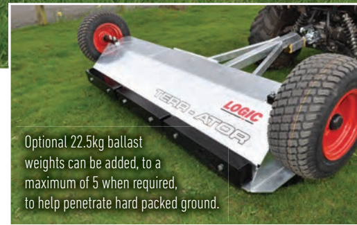
Optional 22.5kg ballast weights can be added, to a maximum of 5 when required, to help penetrate hard packed ground.