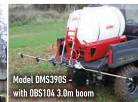
Model DMS390S - with OBS104 3.0m boom

Deck mounted sprayers are easy to mount into a UTV to provide a large 270 litre capacity, with in cab controls.