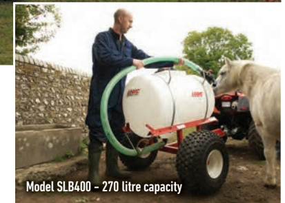
Model SLB400 - 270 litre capacity

Logic Bowers feature a strong chassis and mounting frame fitted with top quality low ground pressure wheels and tyres, suitable for soft ground. They have a large diameter ventilated lid for easy filling and a swivel hitch for added safety.