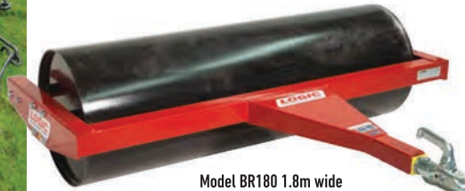
Model BR180 1.8m wide