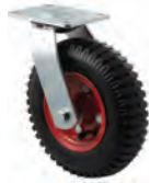
YZP Plate with swivel