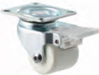
NNN40/NZPBR Plate with swivel and wheel brake