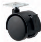
TW50PBR Plate with swivel and wheel brake