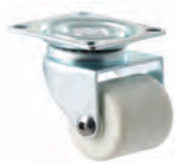
NNN40/NZP Plate with swivel