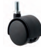
TW5038 Threaded 3/8 pindle