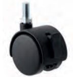
TW5038BR Threaded 3/8 pindle with wheel brake