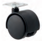
TW50P Plate with swivel