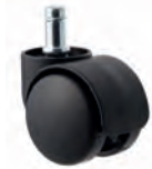
TW50CJ Friction stem