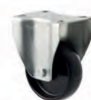
MZF Fixed plate, no swivel