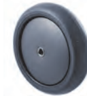
QUQ 1 PU, precision bearing, thread guard