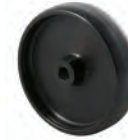
MNN 2 Hard nylon, plain bearing