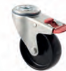
MZHTB Bolt hole swivel and total brake