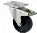
MZPDL Plate with swivel and direction lock