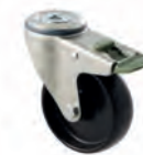
MZHDL Bolt hole swivel and direction lock