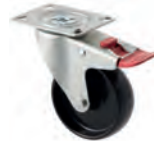
MZPTB Plate with swivel and total brake