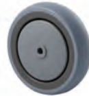
STQ Grey rubber, round profile, precision bearing, thread guard