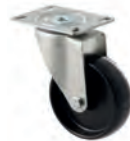
MZP Plate with swivel