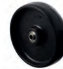
DNQ 3 Hard nylon, precision bearing