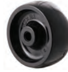
LNN Hard nylon, plain bearing