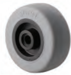
LJP TPE, plain bearing