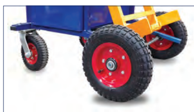
The Rugged Powered All Terrain model, with pneumatic wheels.