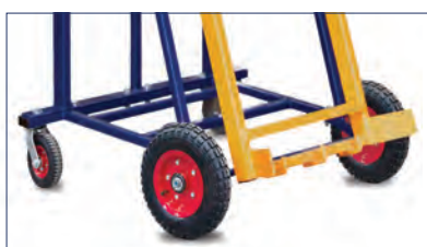
The Rugged Manual All Terrain model, with pneumatic wheels.