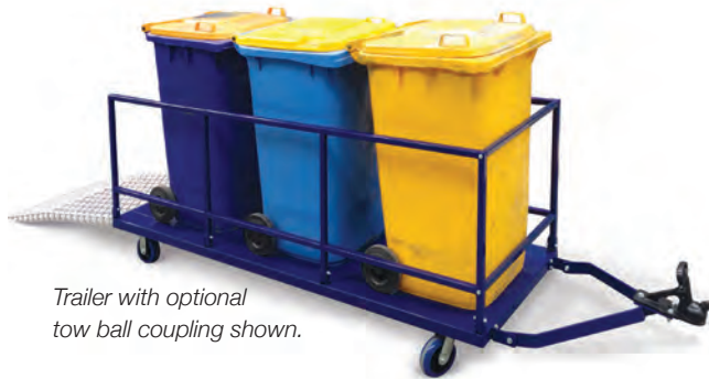
Trailer with optional tow ball coupling shown.