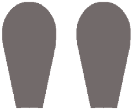
Bunny insides - COTTON - 2 x pieces