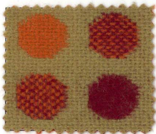
No. 081 Orange (Circle)

Fabric Sample for Takaokaya Products TAKAOKAYA KYOTO JAPAN