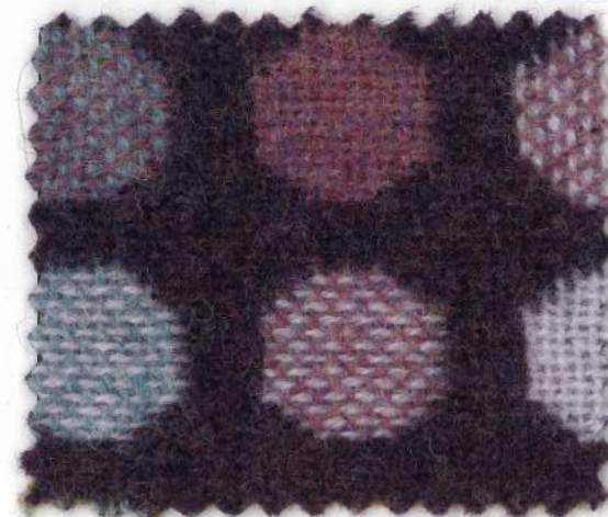
No. 083 Purple (Circle)