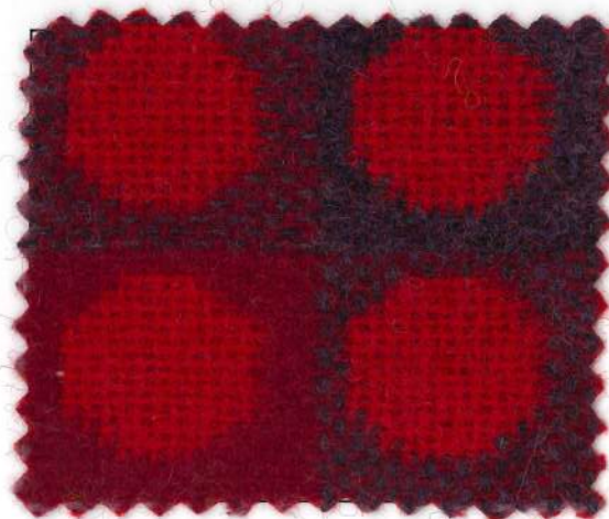
No. 085 Red (Square)