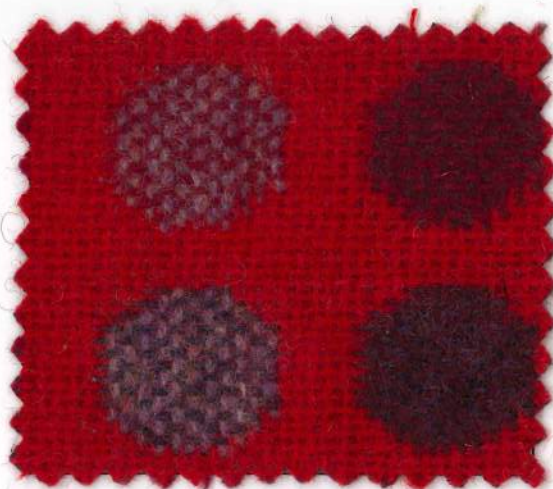
No. 082 Red (Circle)