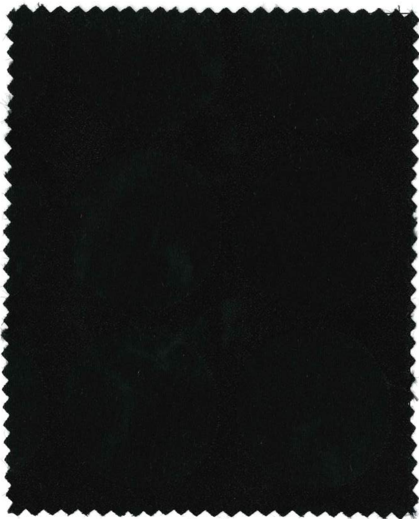
No. 074 Circle