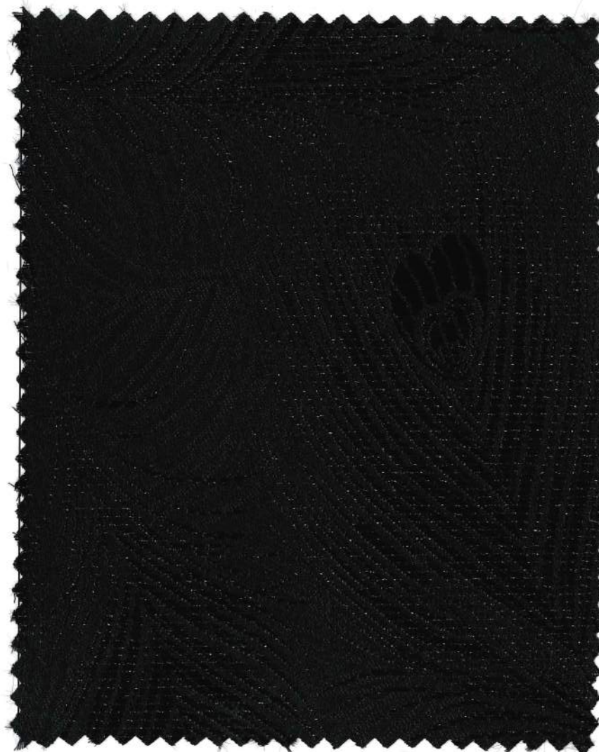
No. 077 Peacock Black