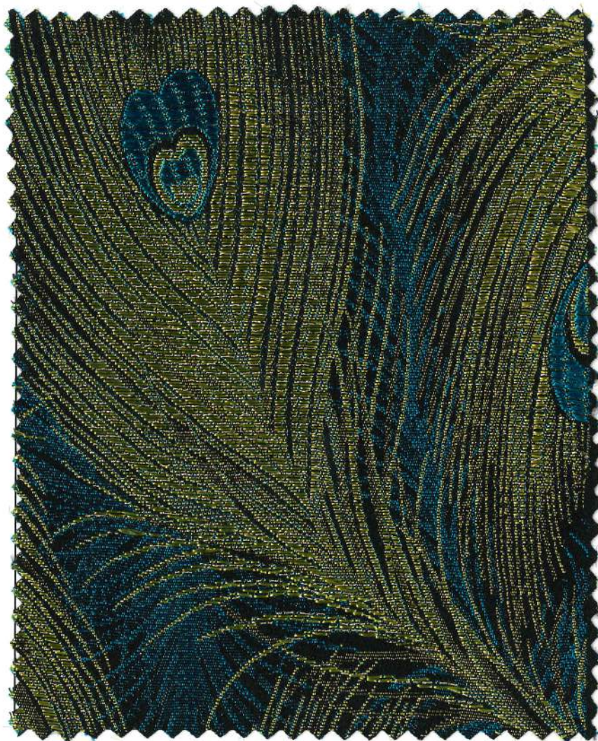
No. 076 Peacock Green