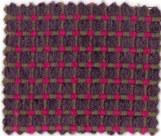
No. 134 Lorne Purple