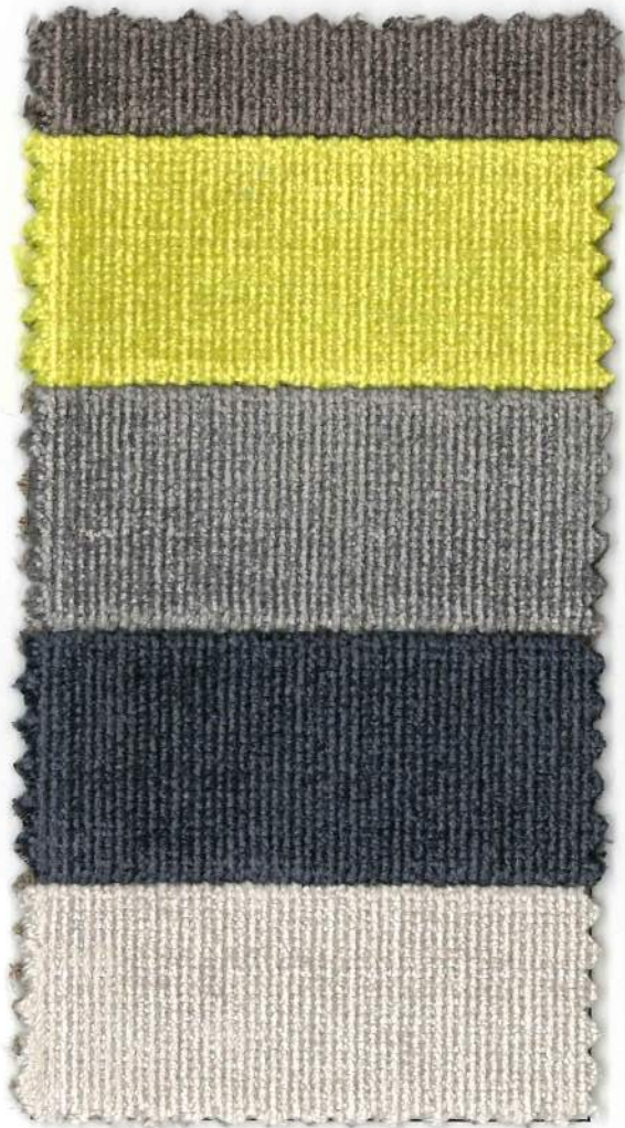
No. 130 Amadei Yellow