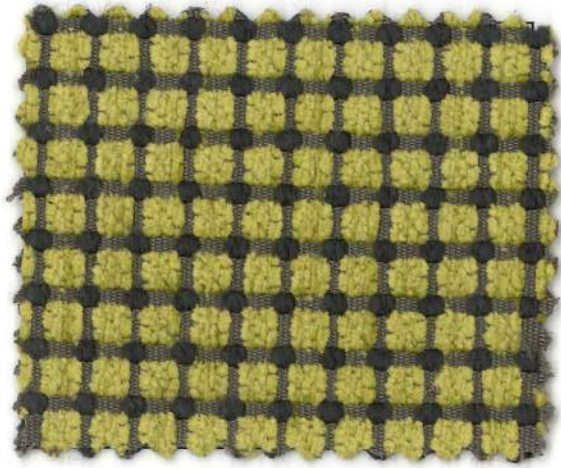
No. 133 Lorne Yellow