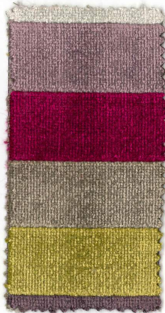
No. 131 Amadei Purple