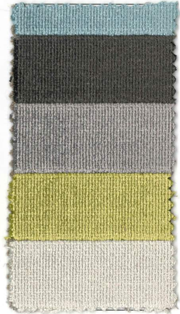
No. 132 Amadei Blue