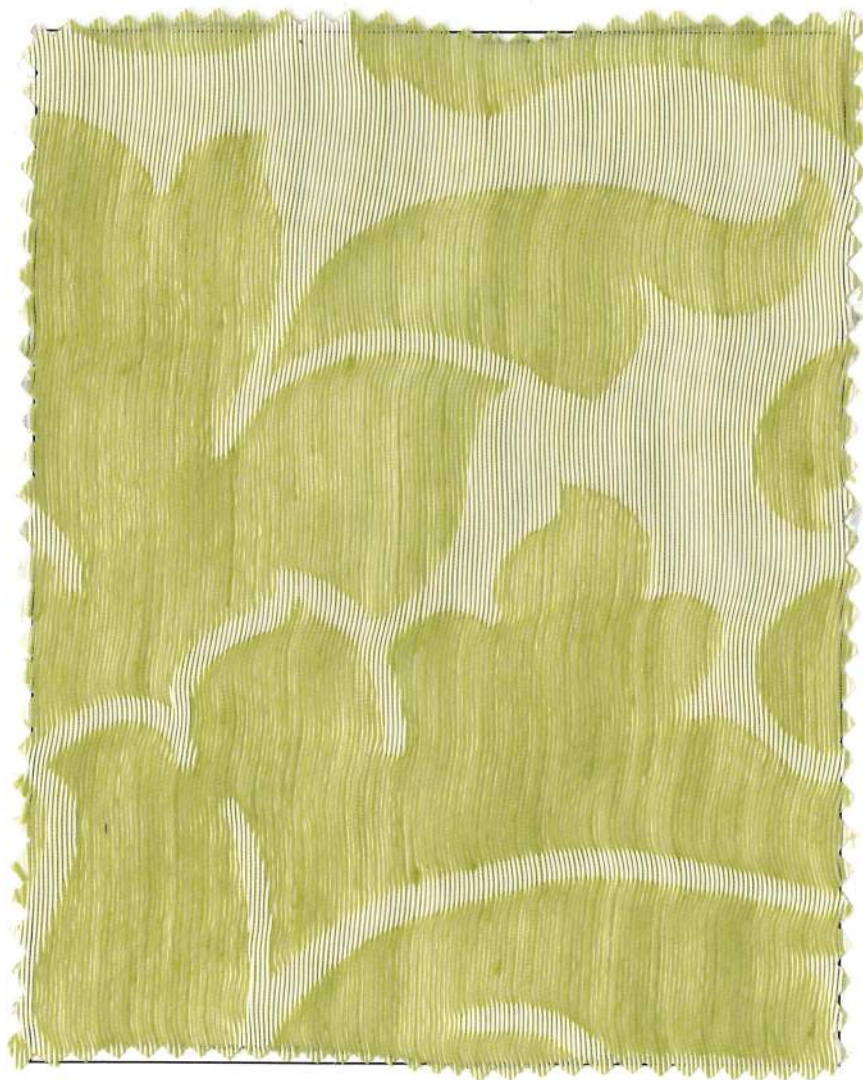
No. 125 Nouvelle Green