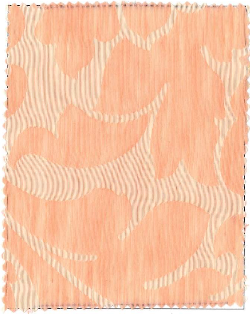
No. 123 Nouvelle Pink