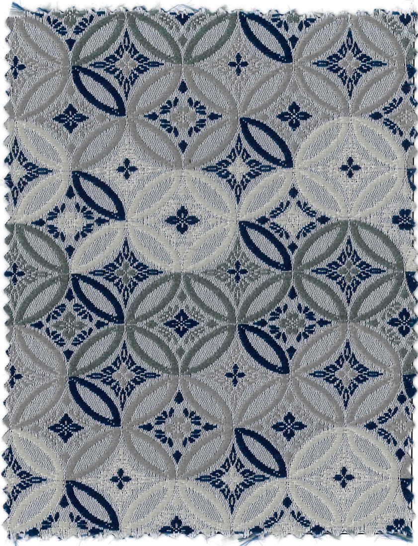
No. 168 Grey