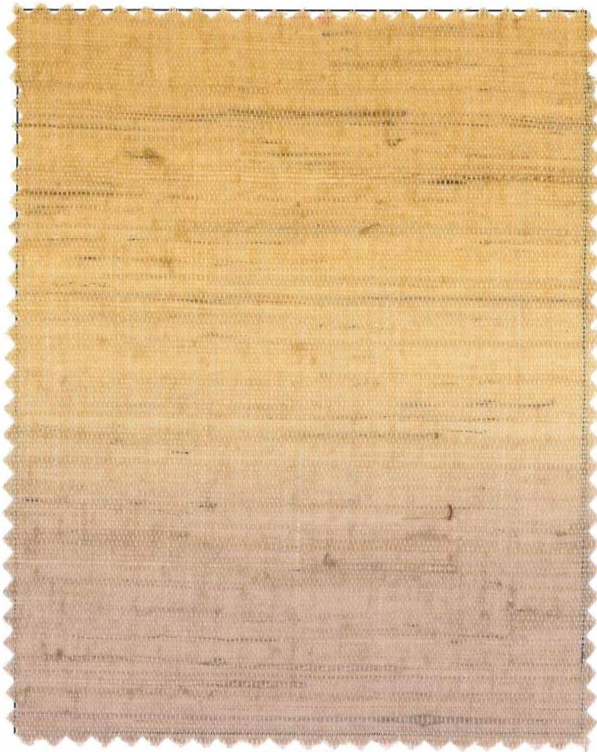
No. 106 Yellow