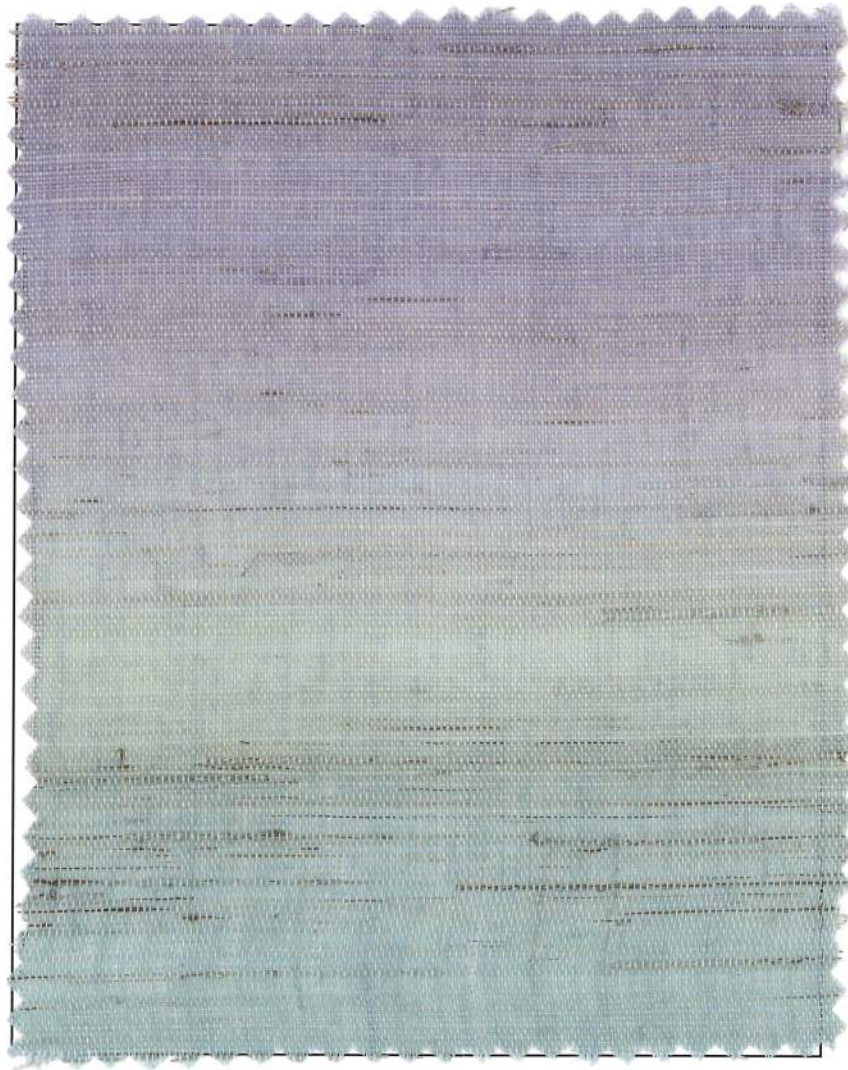
No. 102 Blue