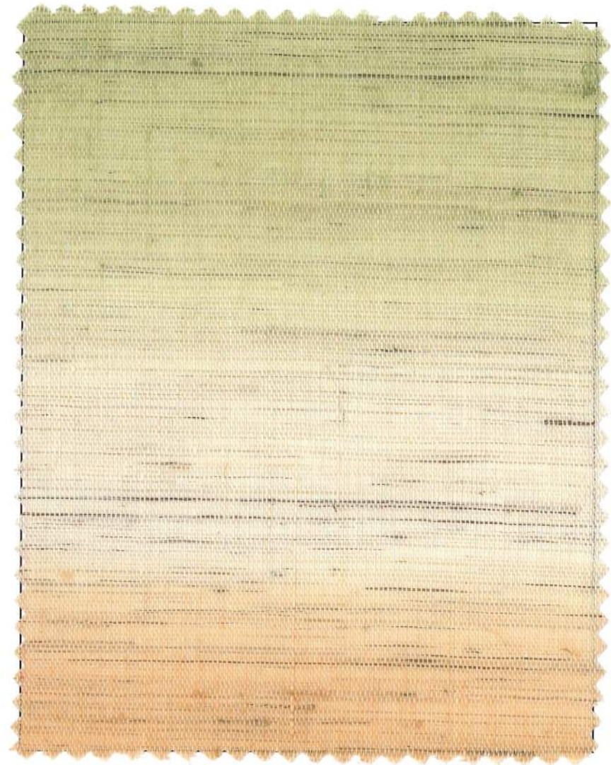
No. 103 Green