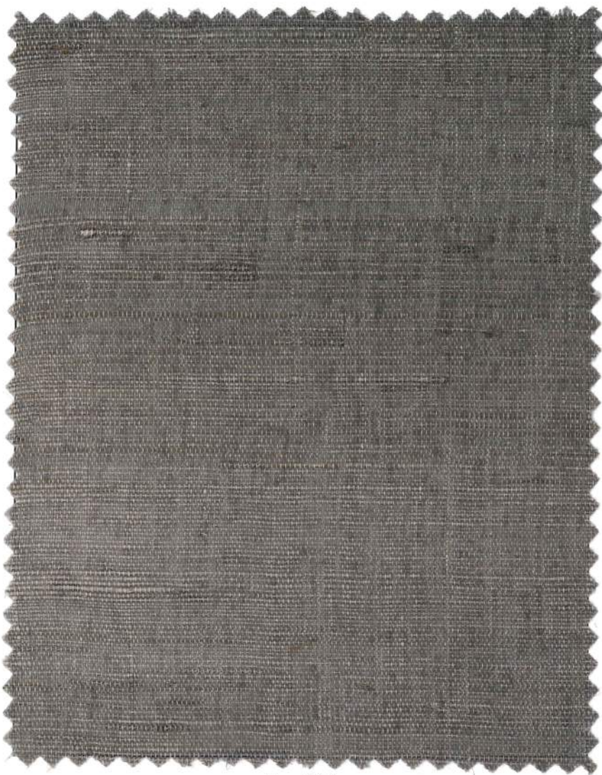
No. 104 Black