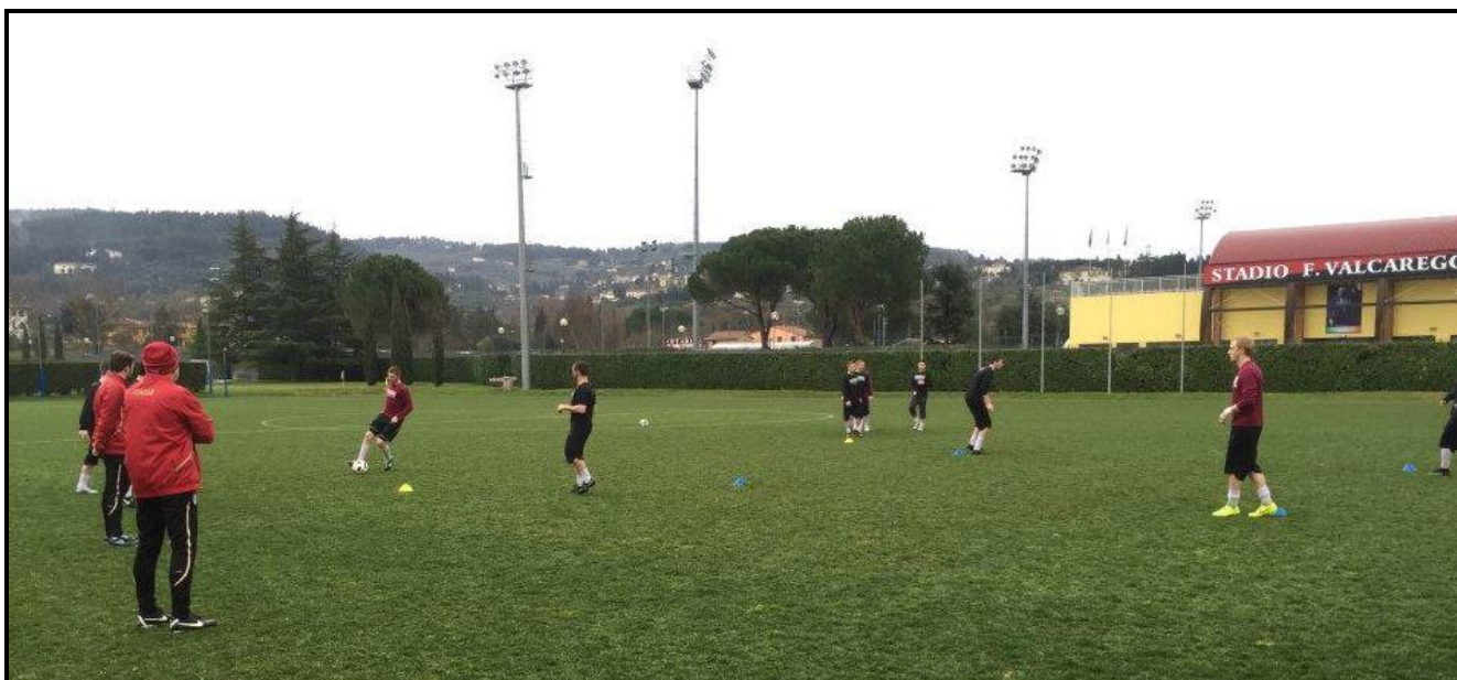
Mens College Team enjoys a training session at Stadio F Valcareggi

PM: Depart from Milan Malpensa International Airport