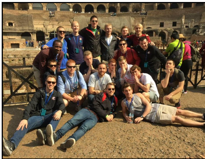
Men's College Team enjoying the sights at the famous Colosseum in Rome