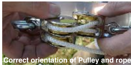
Correct orientation of Pulley and rope

Step 2. Pole assembly: Once all the parts are removed from the top section of the 14 foot pole, slide the extension piece into the top of the pole and lay the pole on an overturned 5-gallon bucket (or similar object). The 3 pole pieces are held in place by friction and gravity.