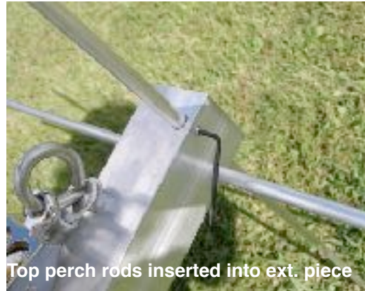
Top perch rods inserted into ext. piece

Step 1 You will need to remove your top perch rods by backing out the set screws (don't loose them) that hold your rods in place. I have provided the allen wrench needed for this step. Also undo the lock nut from your rope assembly and remove the eyebolt assembly from the pole and remove the black cap by popping it out with a flat head screw driver.