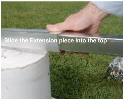
Slide the Extension piece into the top

Note, that the rope that came with your 14 foot pole is 45 feet long. When lowering your hub assembly there is a good chance your rope will be short. Should this be the case simply tie a small piece of rope the length you need to the end of your rope.