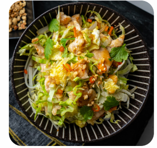
Chicken Pad Thai Small

Manufactured In A Facility That Also Processes: Milk, Egg, Wheat, Peanuts, Soy, Sesame, Cod, Salmon, Almond, Pecan, Mahi, Pine Nut