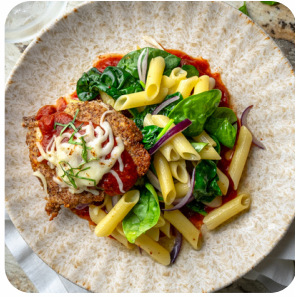
Rustic Chicken Parmesan Regular