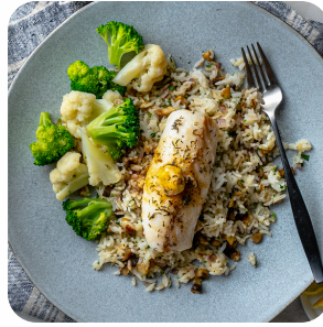
Baked Cod with Compound Cajun Butter Regular

Manufactured In A Facility That Also Processes: Milk, Egg, Wheat, Peanuts, Soy, Sesame, Cod, Salmon, Almond, Pecan, Mahi, Pine Nut