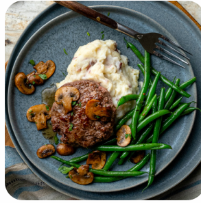
Salisbury Steak Small

Manufactured In A Facility That Also Processes: Milk, Egg, Wheat, Peanuts, Soy, Sesame, Cod, Salmon, Almond, Pecan, Mahi, Pine Nut