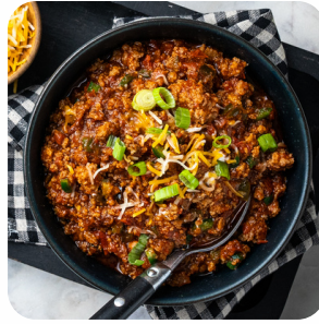
Texas Style Turkey Chili Bowl

Manufactured In A Facility That Also Processes: Milk, Egg, Wheat, Peanuts, Soy, Sesame, Cod, Salmon, Almond, Pecan, Mahi, Pine Nut