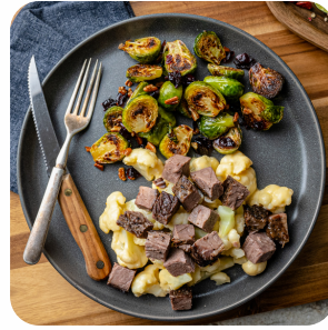
Smoked Brisket Plate Small

Manufactured In A Facility That Also Processes: Milk, Egg, Wheat, Peanuts, Soy, Sesame, Cod, Salmon, Almond, Pecan, Mahi, Pine Nut