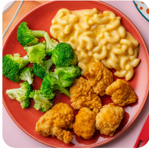
ZedNuggets Over Mac-n-Cheese Small