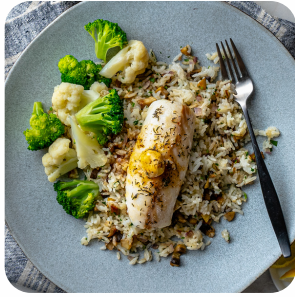
Baked Cod with Compound Cajun Butter Small