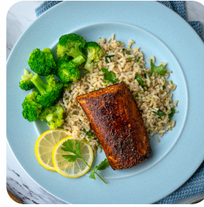
Blackened Mahi Mahi Over Cilantro Lime Brown Rice Small

Manufactured In A Facility That Also Processes: Milk, Egg, Soy