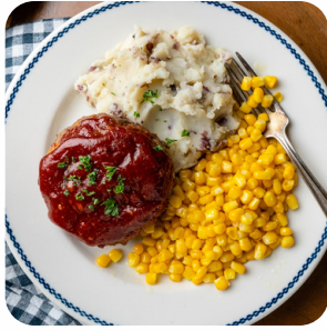
Glazed Beef Meatloaf Regular