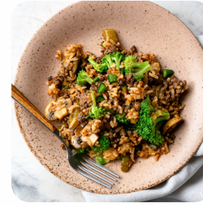
Dirty Rice Regular

Manufactured In A Facility That Also Processes: Milk, Egg, Wheat, Peanuts, Soy, Sesame, Cod, Salmon, Almond, Pecan, Mahi, Pine Nuts