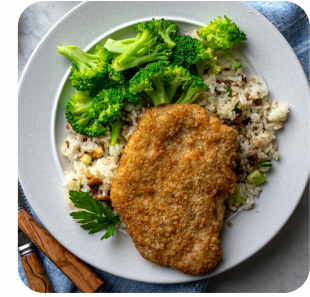
Breaded Chik'n Cutlet Small

Manufactured In A Facility That Also Processes: Milk, Egg, Wheat, Peanuts, Soy, Sesame, Cod, Salmon, Almond, Pecan, Mahi, Pine Nut