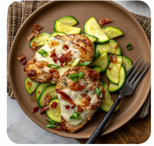
Bacon Ranch Chicken Regular

Manufactured In A Facility That Also Processes: Milk, Egg, Wheat, Peanuts, Soy, Sesame, Cod, Salmon, Almond, Pecan, Mahi, Pine Nut