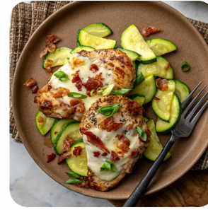
Bacon Ranch Chicken Small

Manufactured In A Facility That Also Processes: Milk, Egg, Wheat, Peanuts, Soy, Sesame, Cod, Salmon, Almond, Pecan, Mahi, Pine Nut