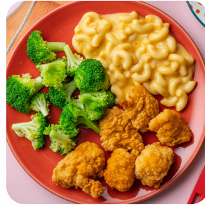
ZedNuggets Over Mac-n-Cheese Regular

Manufactured In A Facility That Also Processes: Milk, Egg, Wheat, Peanuts, Soy, Sesame, Cod, Salmon, Almond, Pecan, Mahi, Pine Nut