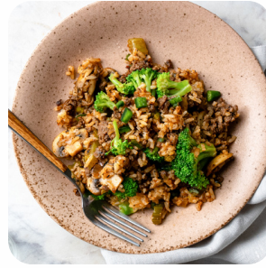
Dirty Rice Small

Manufactured In A Facility That Also Processes: Milk, Egg, Wheat, Peanuts, Soy, Sesame, Cod, Salmon, Almond, Pecan, Mahi, Pine Nut