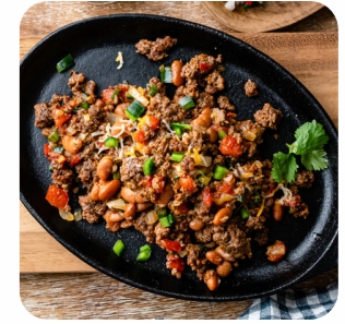
Beef Taco Skillet Regular

Manufactured In A Facility That Also Processes: Milk, Egg, Wheat, Peanuts, Soy, Sesame, Cod, Salmon, Almond, Pecan, Mahi, Pine