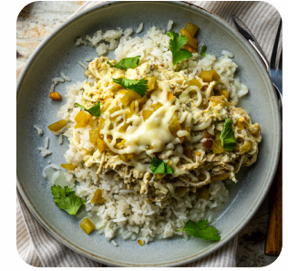
Green Chile Chicken Over Jasmine Rice Small

Manufactured In A Facility That Also Processes: Milk, Egg, Wheat, Peanuts, Soy, Sesame, Cod, Salmon, Almond, Pecan, Mahi, Pine Nut