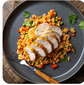
Arroz Con Pollo Regular

Manufactured In A Facility That Also Processes: Milk, Egg, Wheat, Peanuts, Soy, Sesame, Cod, Salmon, Almond, Pecan, Mahi, Pine Nuts