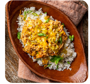
Chicken Enchilada Casserole Small

Manufactured In A Facility That Also Processes: Milk, Egg, Wheat, Peanuts, Soy, Sesame, Cod, Salmon, Almond, Pecan, Mahi, Pine Nut