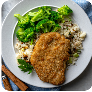
Breaded Chik'n Cutlet Regular