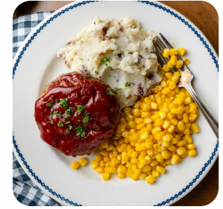
Glazed Beef Meatloaf Small

Manufactured In A Facility That Also Processes: Milk, Egg, Wheat, Peanuts, Soy, Sesame, Cod, Salmon, Almond, Pecan, Mahi, Pine Nuts