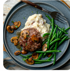
Salisbury Steak Regular

Manufactured In A Facility That Also Processes: Milk, Egg, Wheat, Peanuts, Soy, Sesame, Cod, Salmon, Almond, Pecan, Mahi, Pine Nut