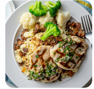
Grilled Chicken with Moroccan CousCous Small

Manufactured In A Facility That Also Processes: Milk, Egg, Wheat, Peanuts, Soy, Sesame, Cod, Salmon, Almond, Pecan, Mahi, Pine Nut