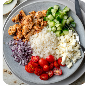
Greek Chicken Bowl Small

Manufactured In A Facility That Also Processes: Milk, Egg, Wheat, Peanuts, Soy, Sesame, Cod, Salmon, Almond, Pecan, Mahi, Pine Nut