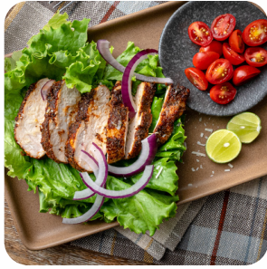
Blackened Chicken Salad with Roasted Red Pepper Ranch