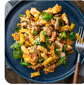
Chicken & Italian Sausage Pasta Regular

Manufactured In A Facility That Also Processes: Milk, Egg, Wheat, Peanuts, Soy, Sesame, Cod, Salmon, Almond, Pecan, Mahi, Pine Nut