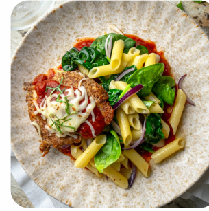
Rustic Chicken Parmesan Small

Manufactured In A Facility That Also Processes: Milk, Egg, Wheat, Peanuts, Soy, Sesame, Cod, Salmon, Almond, Pecan, Mahi, Pine Nut