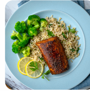
Blackened Mahi Mahi Over Cilantro Lime Brown Rice Regular

Manufactured In A Facility That Also Processes: Milk, Egg, Wheat, Peanuts, Soy, Sesame, Cod, Salmon, Almond, Pecan, Mahi, Pine Nuts