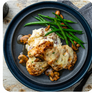
Chicken Madeira Small

Manufactured In A Facility That Also Processes: Milk, Egg, Wheat, Peanuts, Soy, Sesame, Cod, Salmon, Almond, Pecan, Mahi, Pine Nut