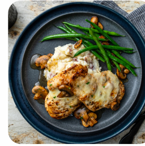
Chicken Madeira Regular

Manufactured In A Facility That Also Processes: Milk, Egg, Wheat, Peanuts, Soy, Sesame, Cod, Salmon, Almond, Pecan, Mahi, Pine Nut