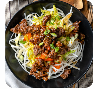
Szechuan Beef Over Rice Noodles Small

Manufactured In A Facility That Also Processes: Milk, Egg, Wheat, Peanuts, Soy, Sesame, Cod, Salmon, Almond, Pecan, Mahi, Pine Nut