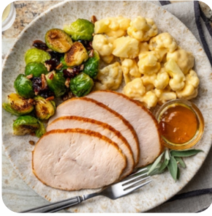
Roasted Turkey with Apricot Sauce Small