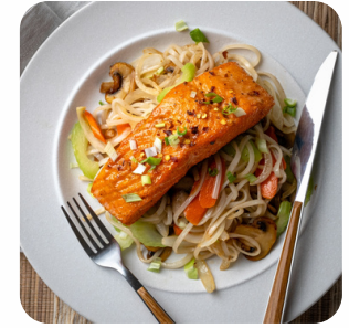
Soy Ginger Glazed Salmon with Stir Fried Noodles Small

Manufactured In A Facility That Also Processes: Milk, Egg, Wheat, Peanuts, Soy, Sesame, Cod, Salmon, Almond, Pecan, Mahi, Pine Nut