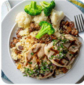
Grilled Chicken with Moroccan CousCous Regular