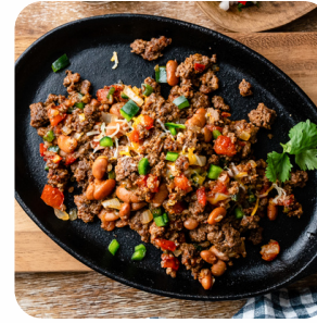
Beef Taco Skillet Small

Manufactured In A Facility That Also Processes: Milk, Egg, Wheat, Peanuts, Soy, Sesame, Cod, Salmon, Almond, Pecan, Mahi, Pine Nut