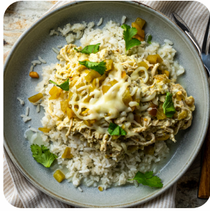
Green Chile Chicken Over Jasmine Rice Regular