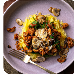
Turkey Ragù Over Spaghetti Squash Small

Manufactured In A Facility That Also Processes: Milk, Egg, Wheat, Peanuts, Soy, Sesame, Cod, Salmon, Almond, Pecan, Mahi, Pine Nut