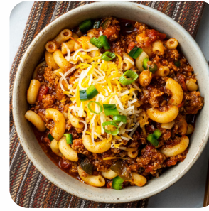
Zedric's Texas Style Chili Mac Bowl Small

Manufactured In A Facility That Also Processes: Milk, Egg, Wheat, Peanuts, Soy, Sesame, Cod, Salmon, Almond, Pecan, Mahi, Pine Nuts