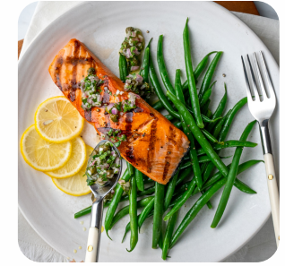
Grilled Salmon Small

Manufactured In A Facility That Also Processes: Milk, Egg, Wheat, Peanuts, Soy, Sesame, Cod, Salmon, Almond, Pecan, Mahi, Pine Nut