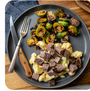
Smoked Brisket Plate Regular

Manufactured In A Facility That Also Processes: Milk, Egg, Wheat, Peanuts, Soy, Sesame, Cod, Salmon, Almond, Pecan, Mahi, Pine Nut