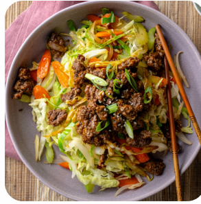
Spicy Beef Stir-Fry Over Wok Fried Cabbage Small

Manufactured In A Facility That Also Processes: Milk, Egg, Wheat, Peanuts, Soy, Sesame, Cod, Salmon, Almond, Pecan, Mahi, Pine Nut