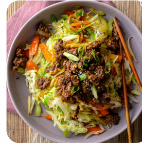
Spicy Beef Stir-Fry Over Wok Fried Cabbage Regular

Manufactured In A Facility That Also Processes: Milk, Egg, Wheat, Peanuts, Soy, Sesame, Cod, Salmon, Almond, Pecan, Mahi, Pine Nut