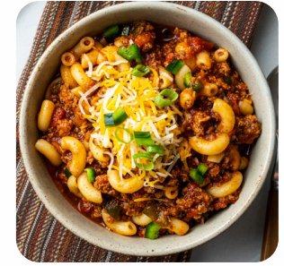
Zedric's Texas Style Chili Mac Bowl Regular

Manufactured In A Facility That Also Processes: Milk, Egg, Wheat, Peanuts, Soy, Sesame, Cod, Salmon, Almond, Pecan, Mahi, Pine Nut