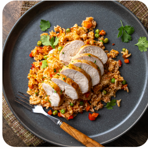
Arroz Con Pollo Small