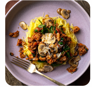
Turkey Ragù Over Spaghetti Squash Regular

Manufactured In A Facility That Also Processes: Milk, Egg, Wheat, Peanuts, Soy, Sesame, Cod, Salmon, Almond, Pecan, Mahi, Pine Nut