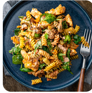
Chicken & Italian Sausage Pasta Small

Manufactured In A Facility That Also Processes: Milk, Egg, Wheat, Peanuts, Soy, Sesame, Cod, Salmon, Almond, Pecan, Mahi, Pine Nuts