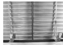
IWS 3187 QTY 2 (2 / shutter)

ELECTRIC MOTORS w/LINKAGE 115/230 Volts .5/.25 Amps each