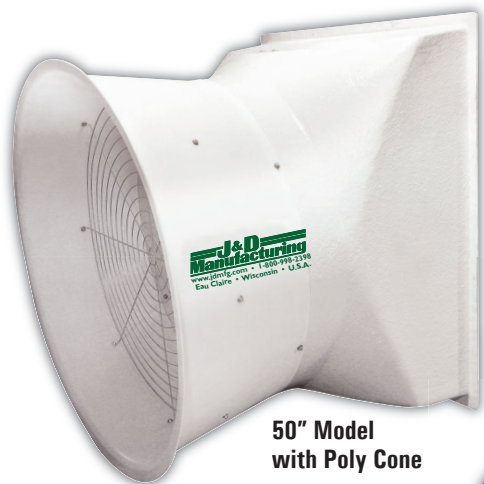
50" Model with Poly Cone