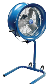
PS Portable Stroller