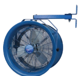
RM Rack Mount