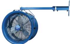
TC Truck Cooler