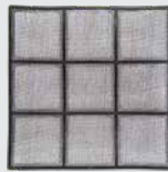
NFS13 WASHABLE NYLON MESH FILTER