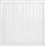
HEPA65-33 HEPA FILTER