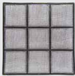
NFS13 WASHABLE NYLON MESH FILTER