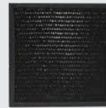
CF15 ACTIVE CARBON FILTER