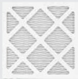
PF13 PLEATED MEDIA FILTER