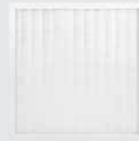
HEPA50-33 HEPA FILTER