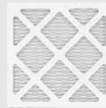
PF13 PLEATED MEDIA FILTER