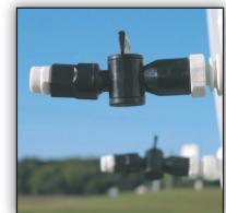
Independent Shut-Off Nozzles