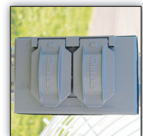
Independent Fan & Mist Switches