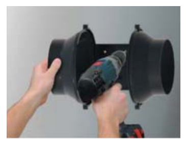
Fix the fan mounting plate on the flat surface.