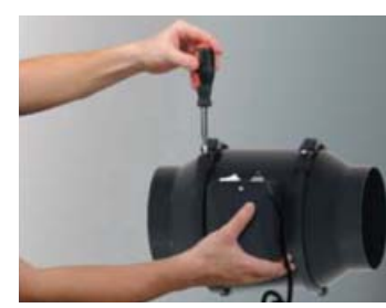
Secure latches by screws.