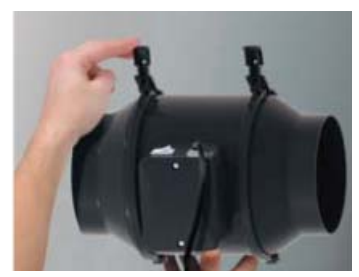
Lock the removable body by clamps with latches