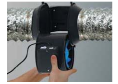
No dismantling or disassembling! Just remove the central body from the case and complete the servicing!