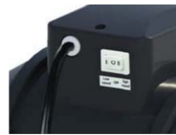
Select a required speed by the built-in speed switch. ENJOY the FRESH AIR.