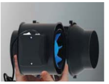
Install the removable body inside the fan case.