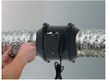
Attach the ducts with clamps.