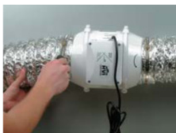
Attach the ducts with clamps.