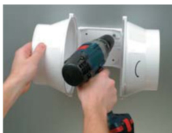
Fix the fan mounting plate on the fl at surface.