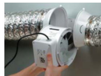
No dismantling or disassembling! Just remove the central body from the case and complete the servicing!