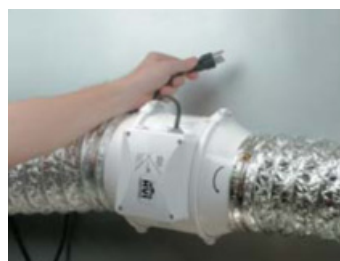
Insert the plug into electrical socket - the fan is READY TO GO!