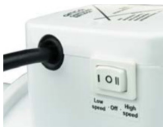
Select a required speed by the built-in speed switch. ENJOY the FRESH AIR.