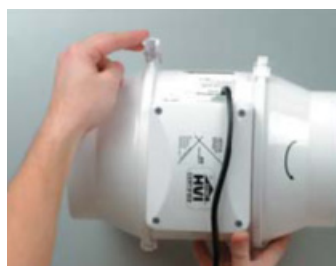
Lock the removable body by clamps with latches.