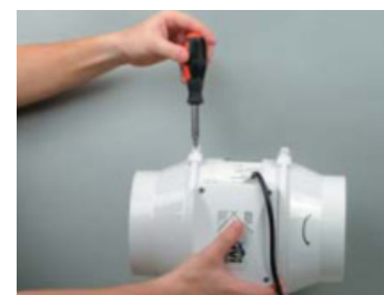
Secure latches by screws.