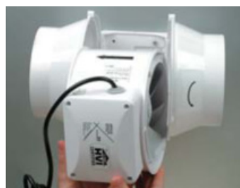
Install the removable body inside the fan case.