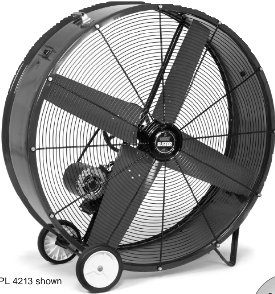
SPL 4213 shown