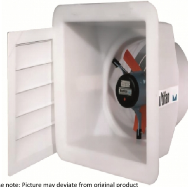
Please note: Picture may deviate from original product