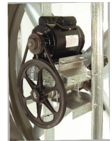
X-WING BELT TENSIONER

Optional 50 Hz motors are available with belt drive units.