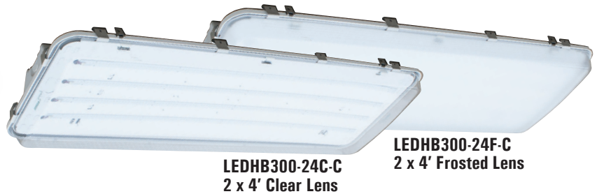
LEDHB300-24C-C 2 x 4' Clear Lens

Same great performance as our standard LED High Bay Strip Lights