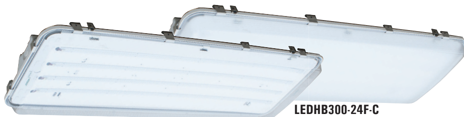
LEDHB300-24C-C 2 x 4' Clear Lens