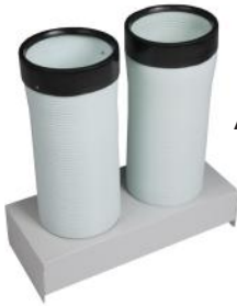
Air Chutes - Conditioned air supply, equipped.