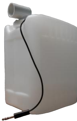
Condensate Tank - 3-gal Condensate Tank with float assembly for automatic cutoff.