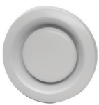
BOC Interior Air Valve