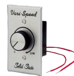
SC 15 Variable speed control

Please refer to the S&P Group A (Residential/Light Commercial) catalog for a complete line of accessories.