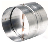
CAR Backdraft Damper