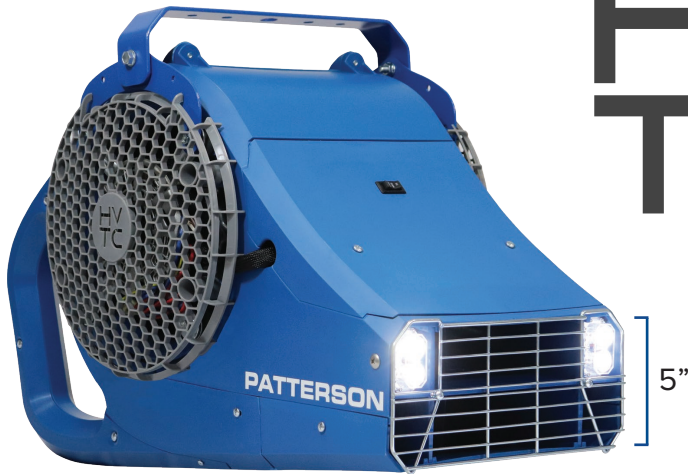
Optional Integrated LED Lights