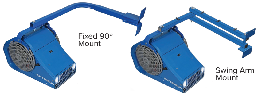
Fixed 90° Mount