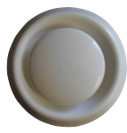
EXHAUST & SUPPLY GRILL