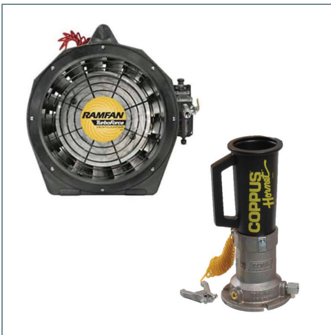
Explosion Proof Fans