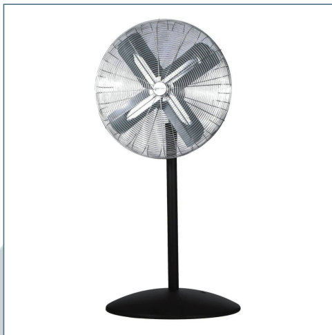
Air Circulation Fans