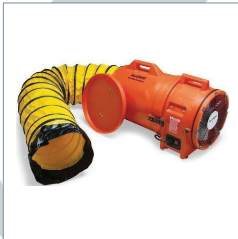
Confined Space Blowers