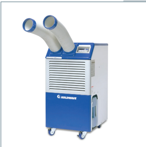
Portable AC Units