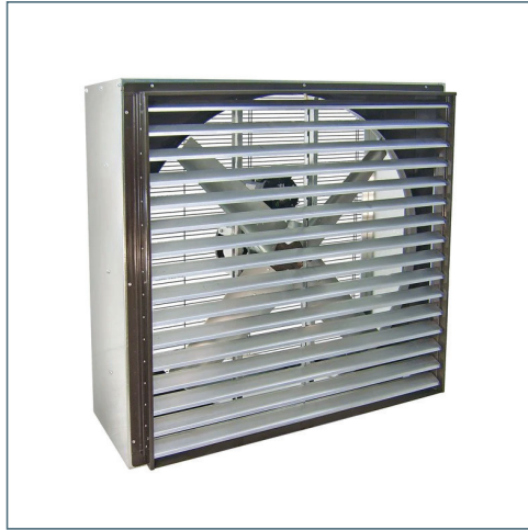
Wall Exhaust/Supply Fans