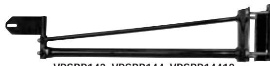
VRSBR143, VRSBR144, VRSBR14412

Due to our continual effort to provide the best products available and adhere to market conditions; literature, products, prices and availability are subject to change without notice.