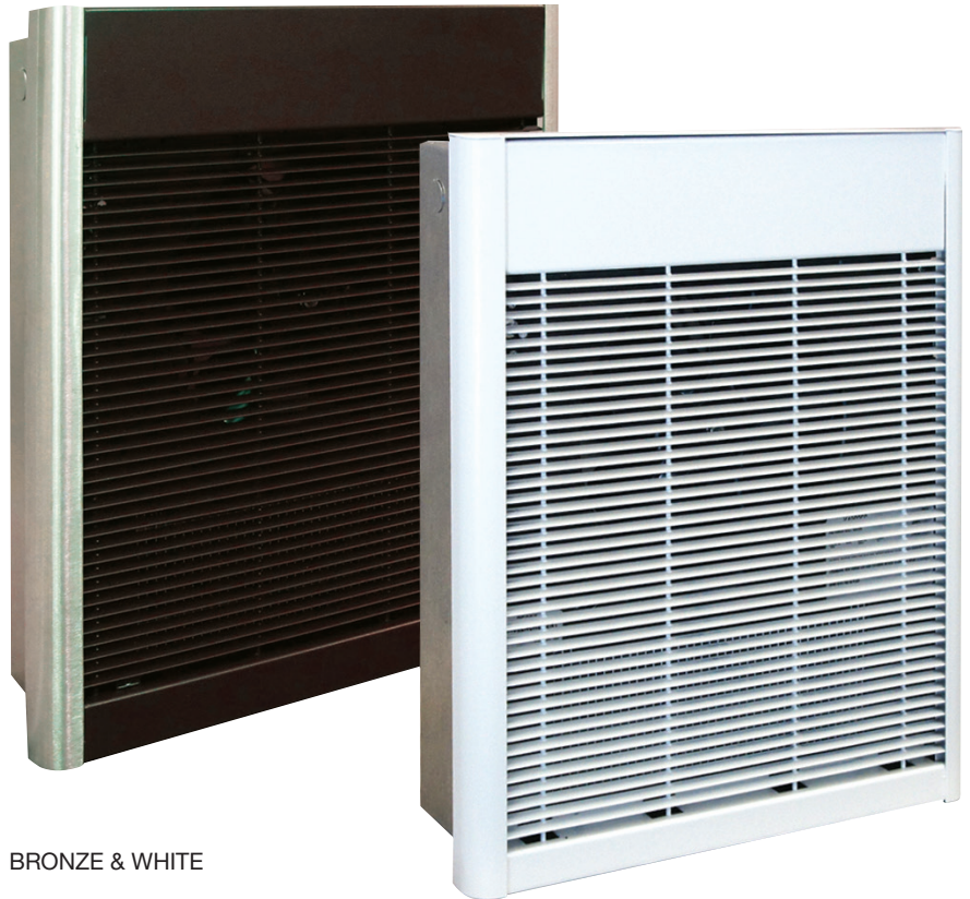
BRONZE & WHITE