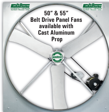
50" & 55" Belt Drive Panel Fans available with Cast Aluminum Prop

⚠ WARNING: This product can expose you to chemicals including lead, which is known to the State of California to cause cancer and birth defects or other reproductive harm. For more information go to www.P65Warnings.ca.gov/product .