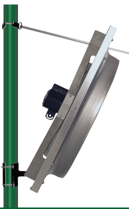
In-line Column Mount