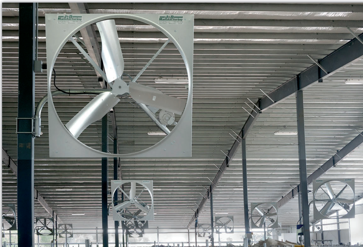
Belt Drive Panel Fans with Galvanized Prop and VRSBR06X Swivel Offset 6" Square Column Mounting Brackets