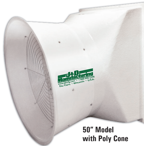
50" Model with Poly Cone