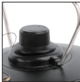
Brightness Adjustment Switch

As this is a rechargeable camping lantern, please charge the battery first before use.