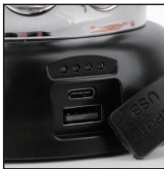
USB-C Ladeport/ Ausgangsport