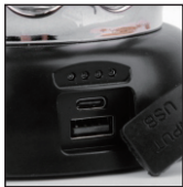
USB-C Charging Port/ Output Port