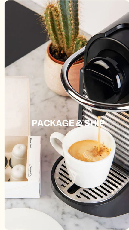
PACKAGE & SHIP

Measured precisely to ensure each pod contains the correct amount for a consistent cup of coffee. Pods are then sealed protecting against oxygen & moisture preserving aroma & flavour.