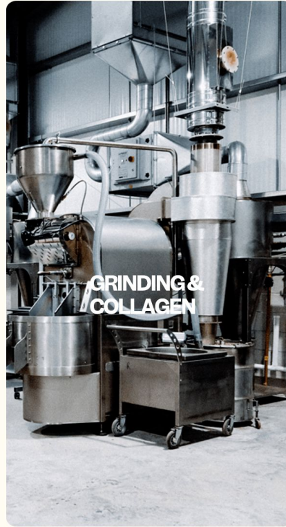
GRINDING & COLLAGEN

Selected beans are roasted in batches with precise temperature & timing control to develop the unique flavour profile. After reaching desired roast level beans are then cooled to halt roasting process & preserve flavour compounds.