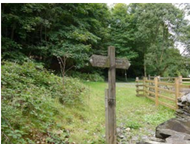
Entrance to the wood