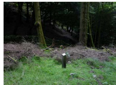
Post and plaque