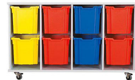
4HM13 8x Jumbo