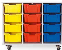
HM2 12x Deep