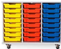
HM1 24x Shallow