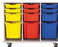
HM7 6x Shallow 3x Deep 3x Jumbo