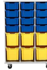
TM4 12x Deep & 6x Jumbo