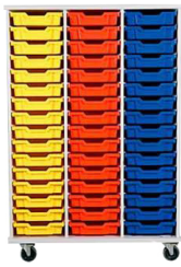
TM1 48x Shallow