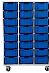
TM2 24x Deep