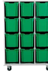
TM3 12x Jumbo