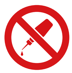
Do not glue this part

These are a series of icons that may be used throughout the instructions to help your assembly. If in doubt, scroll ahead to confirm.