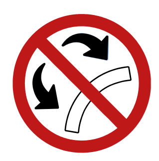
FRAGILE: DO NOT BEND. "Bendy wood" is designed to curve around a designed frame only.