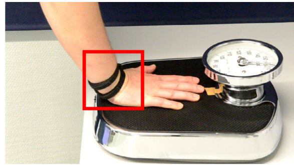
Fig. 1. The weight-bearing test with attached WristWidget.