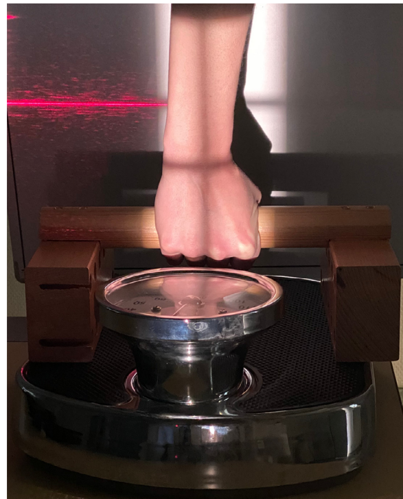
Fig. 2. Examination of the dynamic ulnar variance with weight-bearing test.

a wooden bar while giving axial load on the examination table (Fig. 2). For cases who had an MRI, the TFCC-lesion was classified as suspicious for traumatic or degenerative origin. The type of TFCC lesion and need for operative stabilization of the distal radioulnar joint by TFCC-reconstruction, refixation or ulnar shortening were obtained from surgery records.