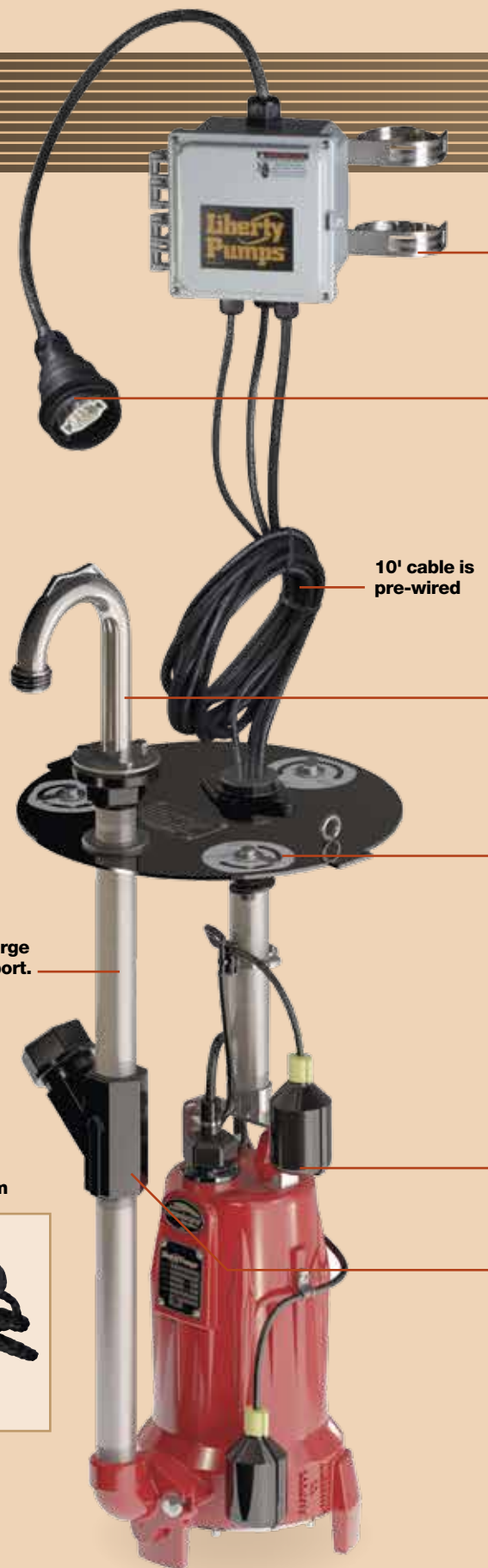
10' cable is pre-wired