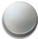
Polished White Copper