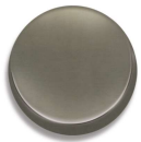
Brushed White Copper

HAMATUSA has a wide range of finish options, utilizing various technologies: fully automated polishing and brushing plating line, electrostatic powder coating line, and PVD capabilities that allow for a vast range of different finishes such as metallic, brass, pewter, copper and practically any other finish possible.