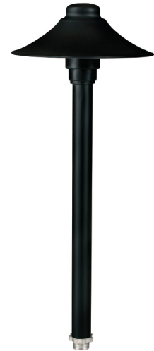
CL-639-BK-12 12" Stem (Optional) Shown