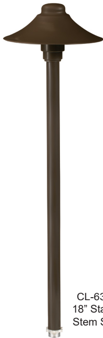
CL-639-BZ 18" Standard Stem Shown