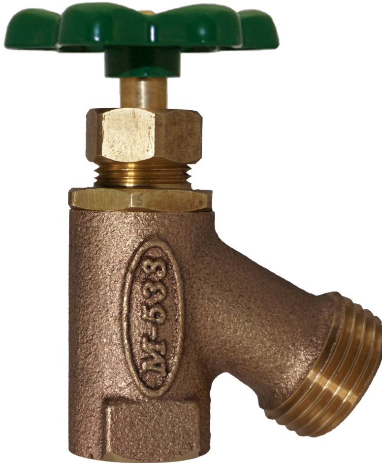
533 Series Garden Valves